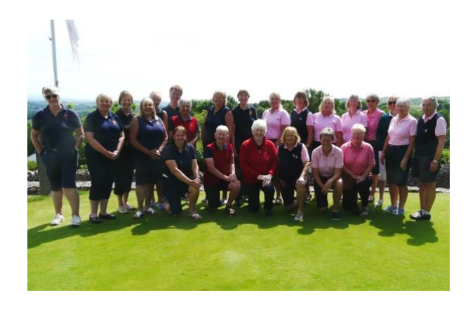
Lancashire & Cumbria Teams