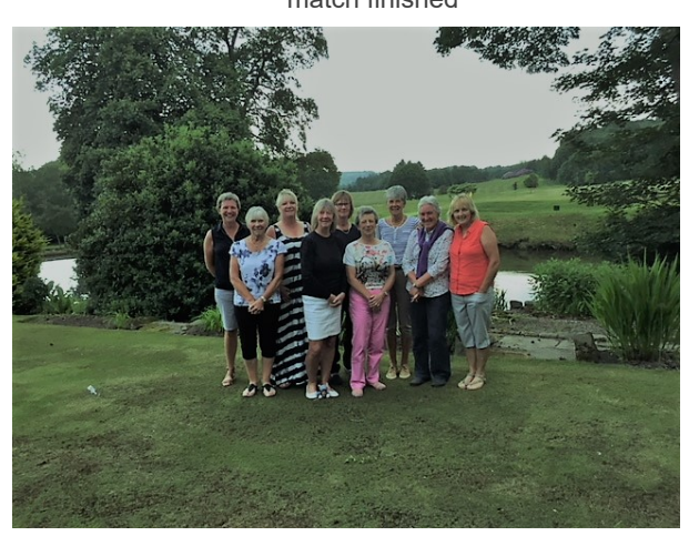
Evening in the garden of the Dormy house