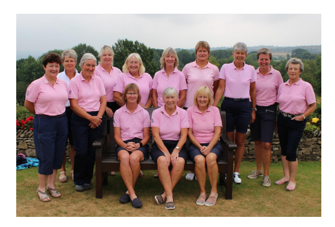
Cumbria Ladies 2018