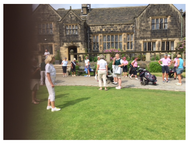
Cumbria players and caddies by the17th green after the match finished