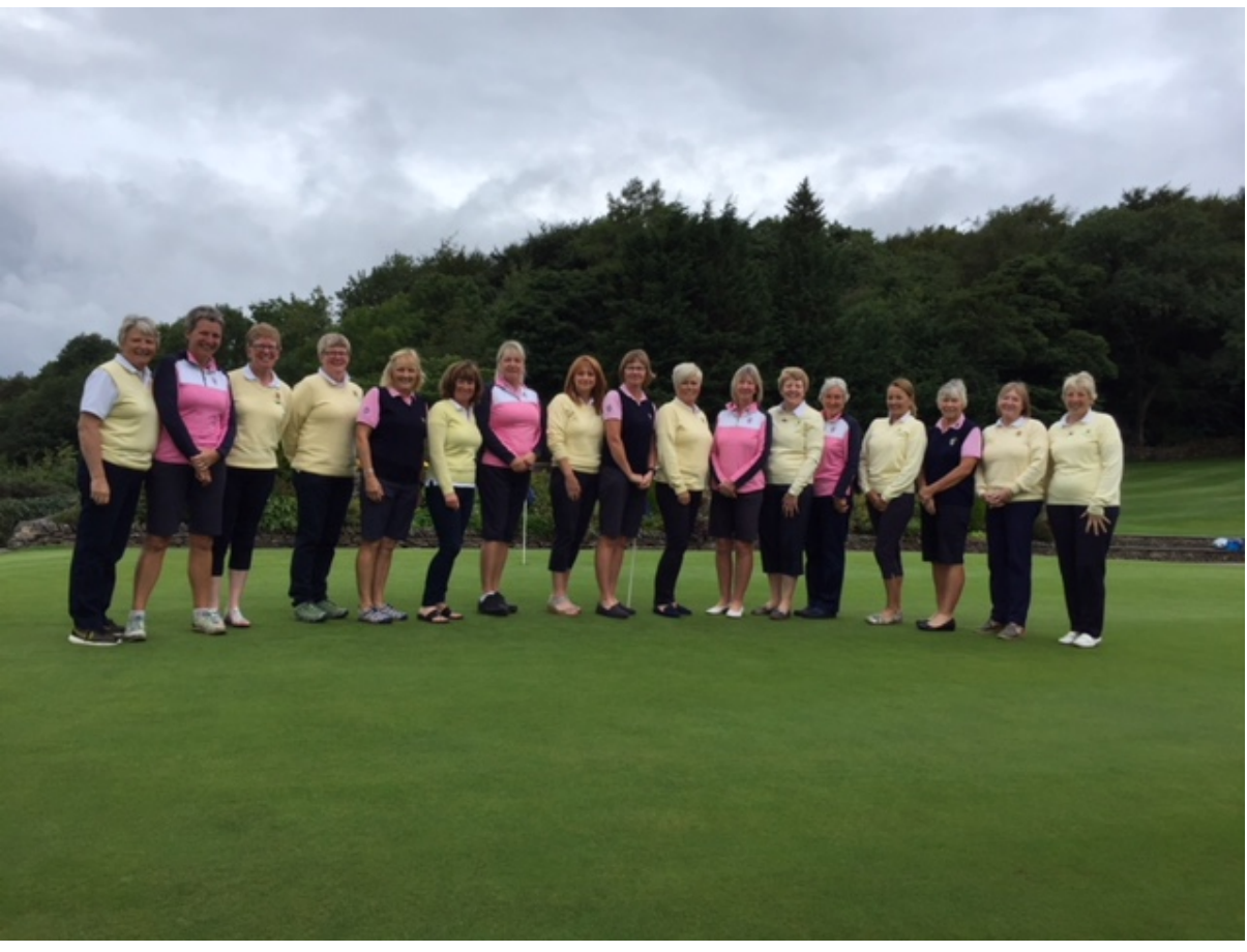
Cumbria and Northumberland teams