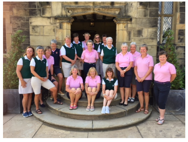
Cumbria and Yorkshire mingle together on the steps of Woodsome Hall GC