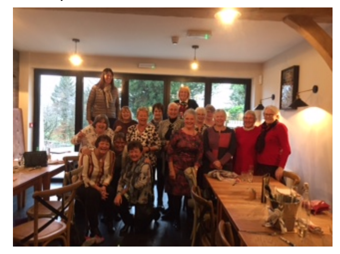
What a start to the 2018/9 Season the committee lunch at Hare & Hounds Levens and a very fitting end to a superb year for Cumbria Vets