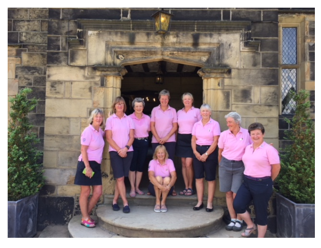
The front of Woodsome Hall GC