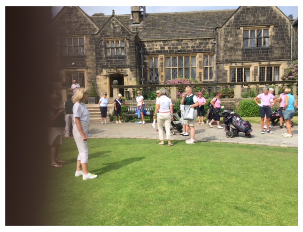
Cumbria players and caddies by the17th green after the match finished