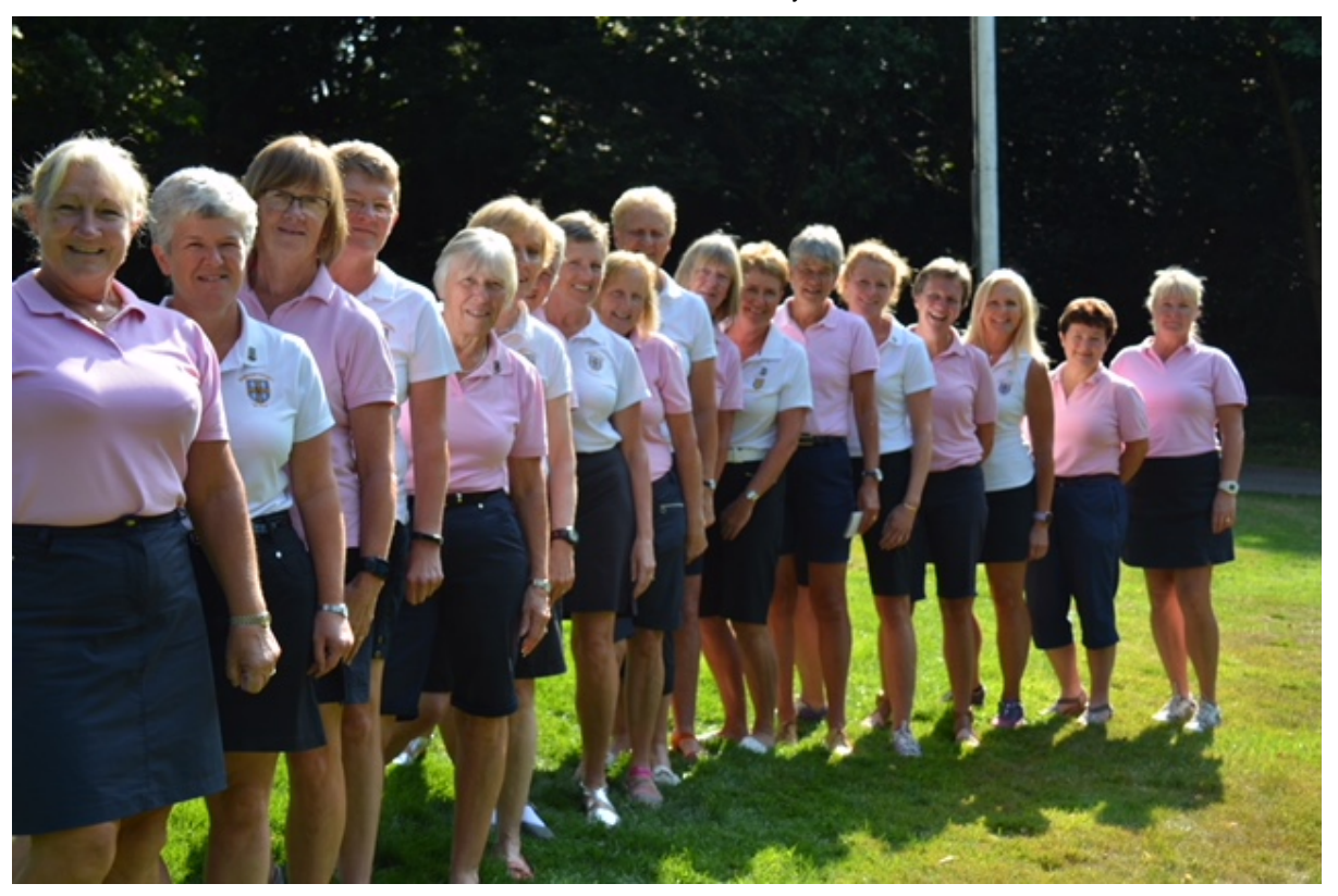
Cumbria & Durham Teams