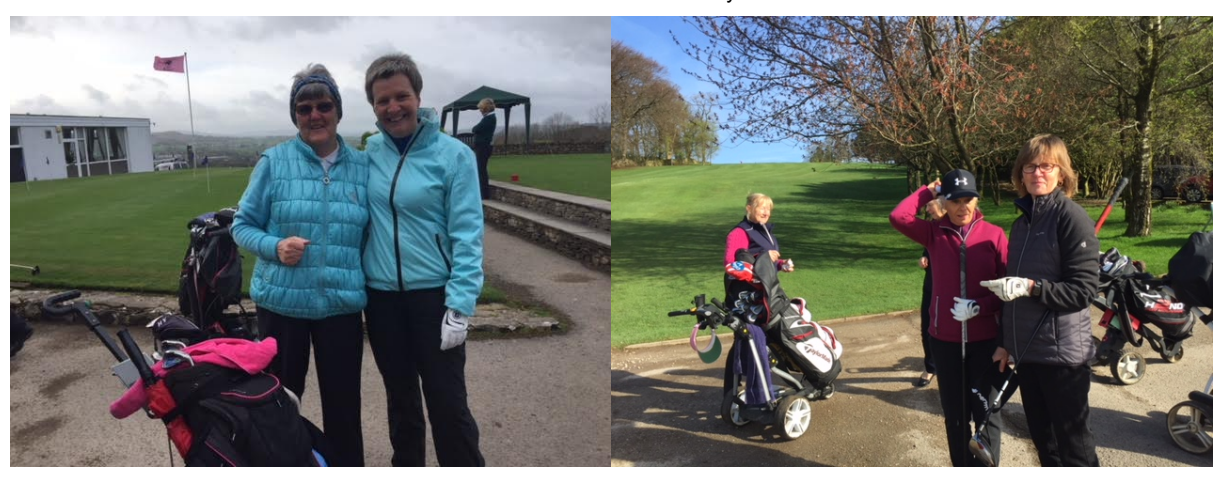
TEAM EVENT 2018