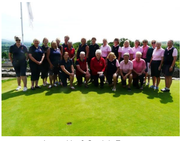
Lancashire & Cumbria Teams