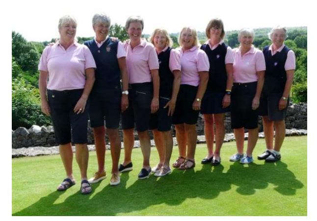
Cumbria Team for the match against Lancashire at Kendal 2018