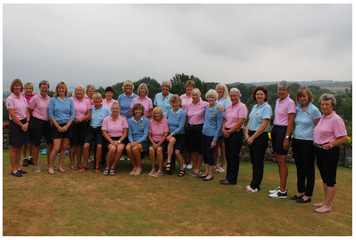
Cumbria & Cheshire Ladies 2018